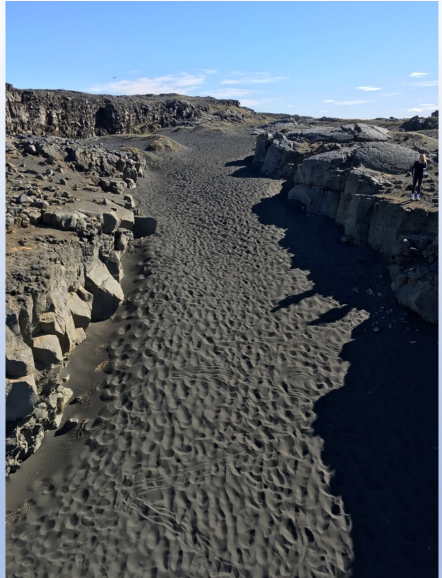
The Continental Divide