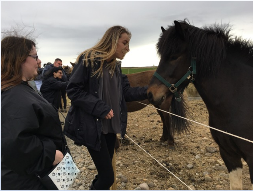
Icelandic Ponies loved us