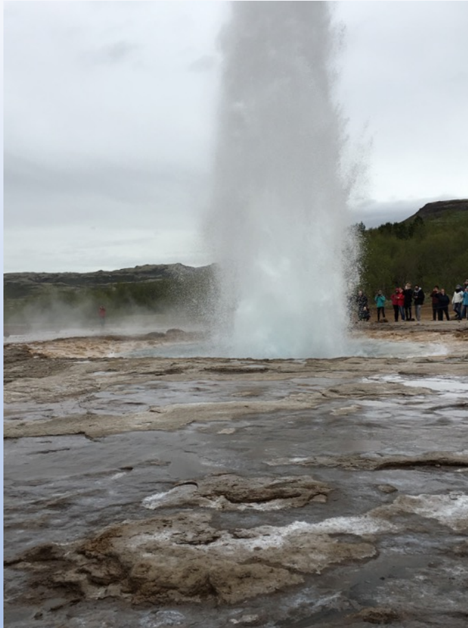
Geysirs blast away!